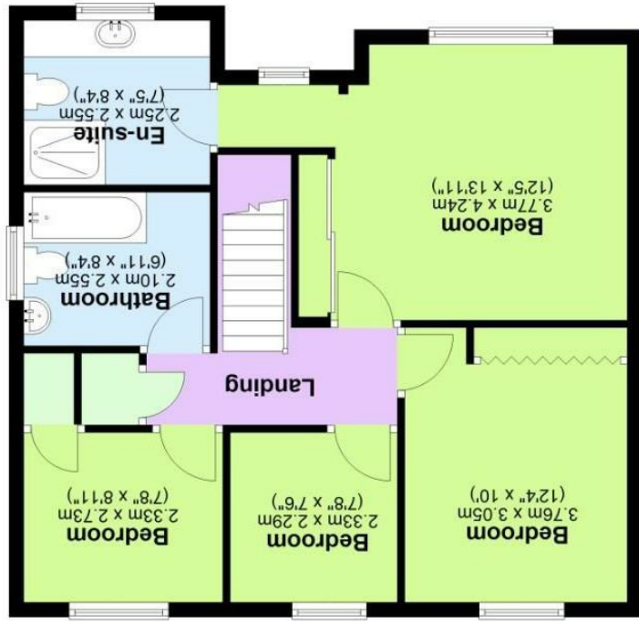
Approx. 62.1 sq. metres (668.1 sq. feet)