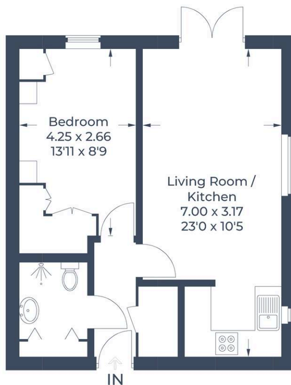
Illustration for identification purposes only, measurements are approximate, not to scale. © CJ Property Marketing Produced for Chandlers