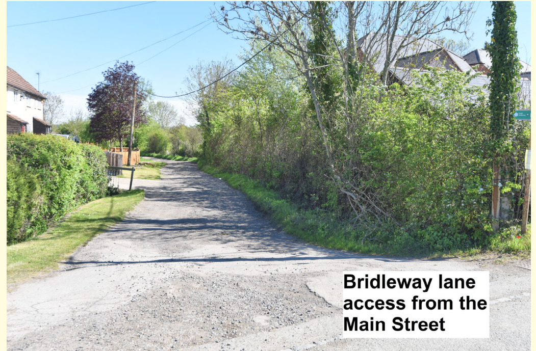
Bridleway lane access from the Main Street