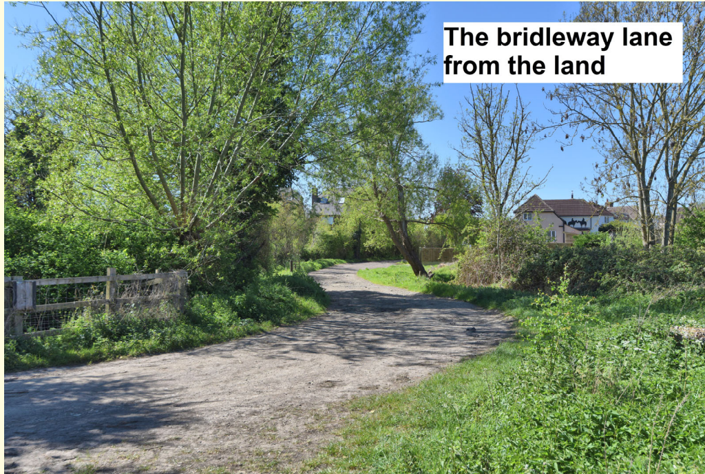
The bridleway lane from the land