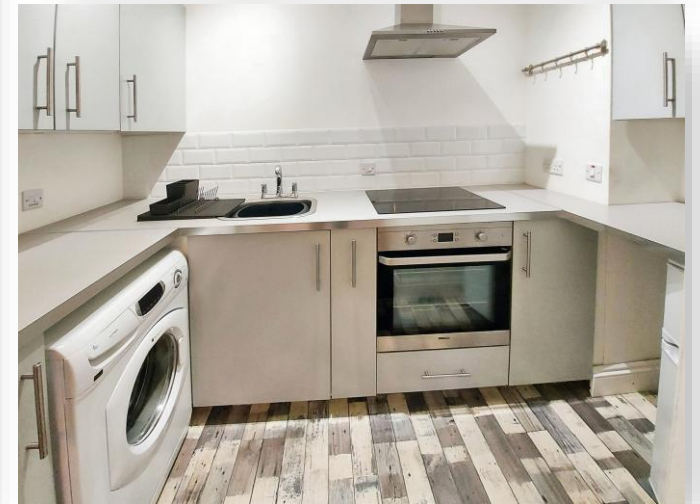
St. Andrews Lane, Minehead, TA24 5UR