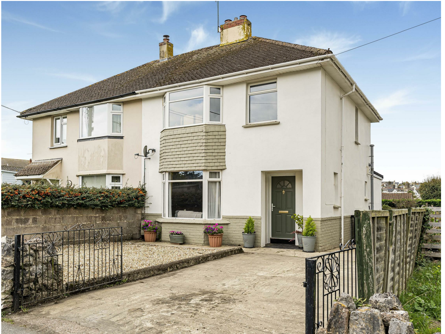
9 Wesley View