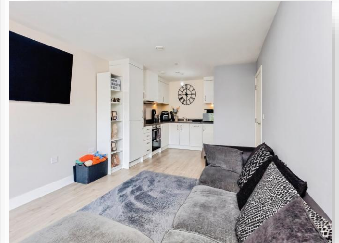
27 Bembridge House Station Road, Corby NN17 1UE