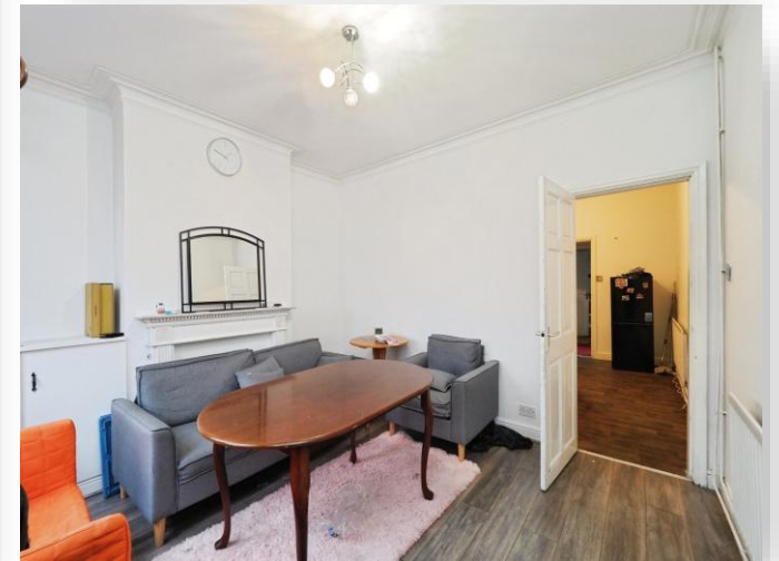
Queens Road, Loughborough