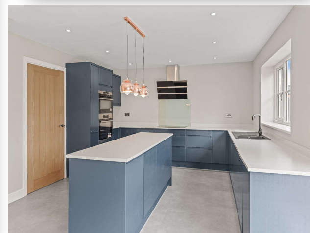
Woodcroft House High Gate, Helpringham Sleaford NG34 0RD