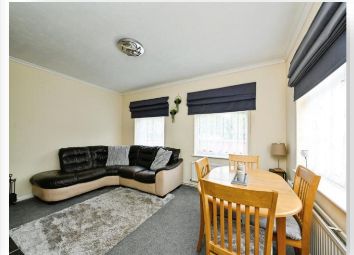
Rosina, Isle Road, Outwell, WISBECH, PE14 8TD