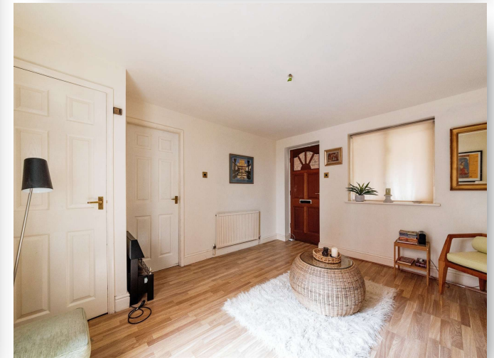
Stodman Mews, Newark NG24 1DE