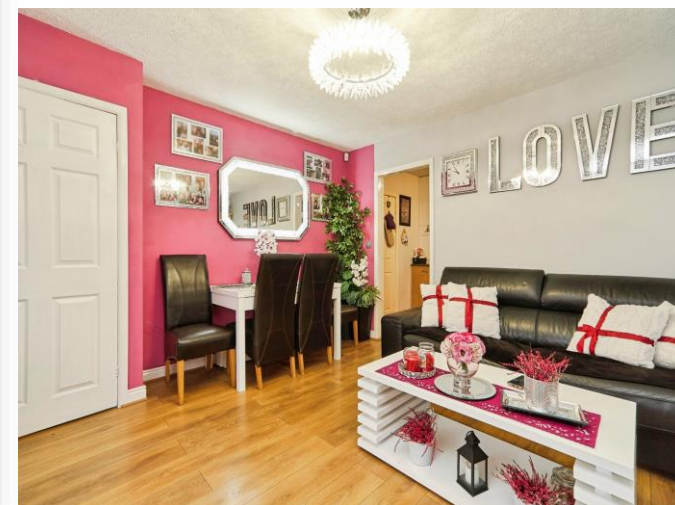
Crag Road, Shipley BD18 2EX