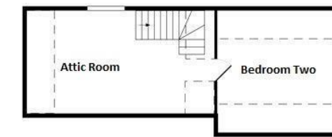
2ND FLOOR APPROX. FLOOR AREA 475 SQ. FT. (44.1 SQ. M.)