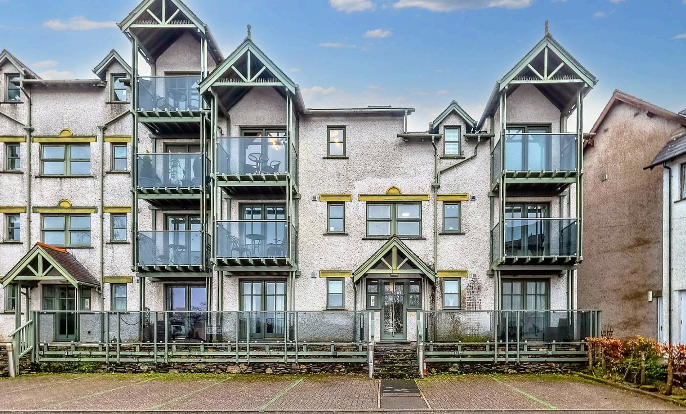
Flat 15, College Gate Elleray Road, Windermere £229,500