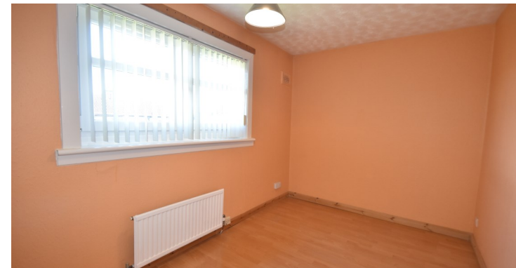
4 Letham Grove