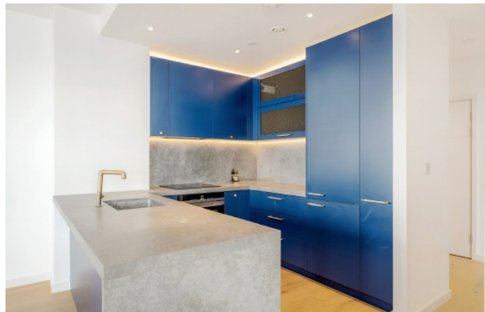
Goodluck Hope Walk, E14