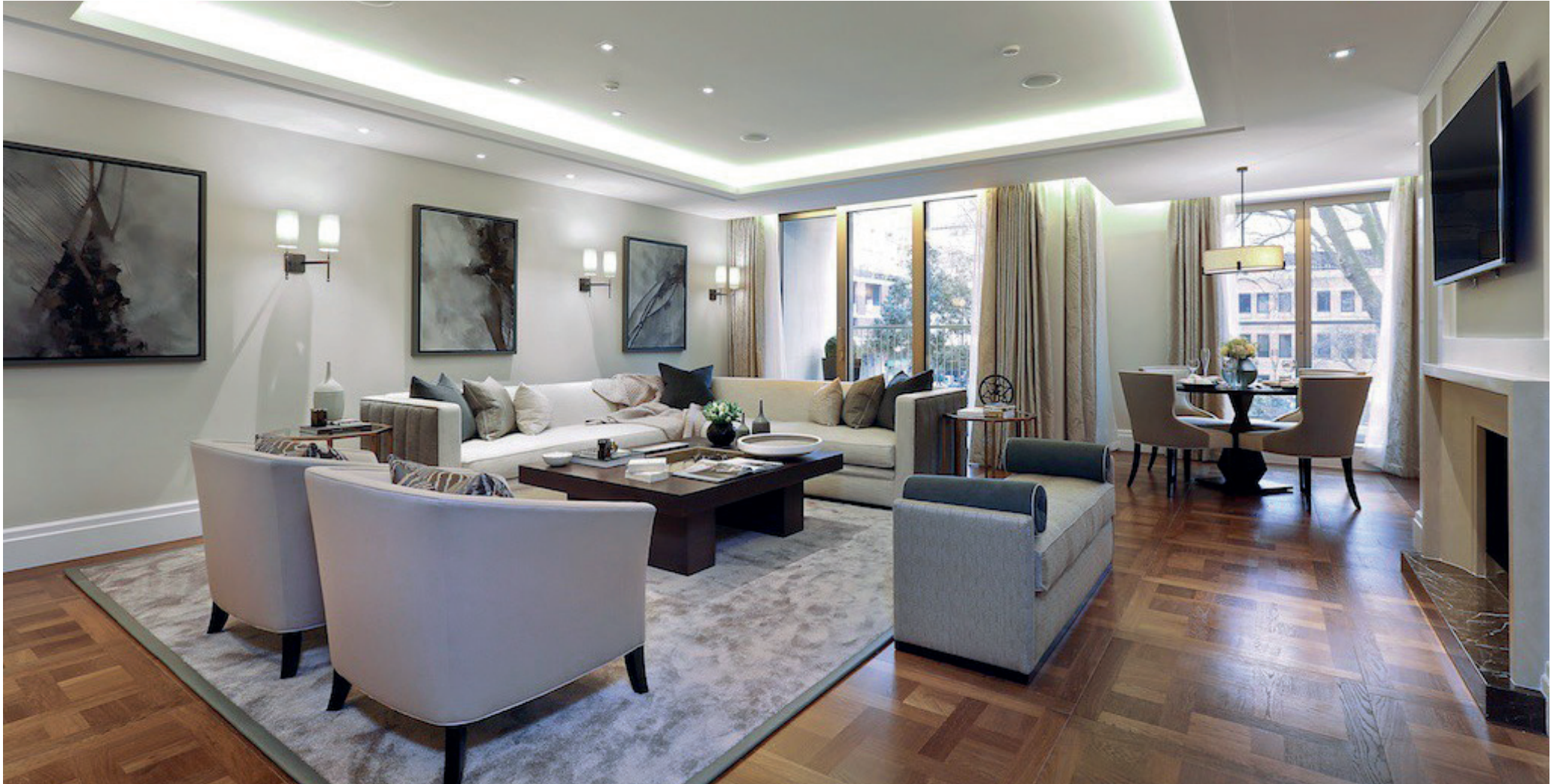
EBURY SQUARE, Belgravia SW1W