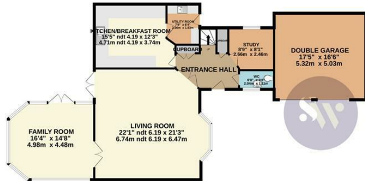
GROUND FLOOR 1369 sq.ft. (127.2 sq.m.) approx.