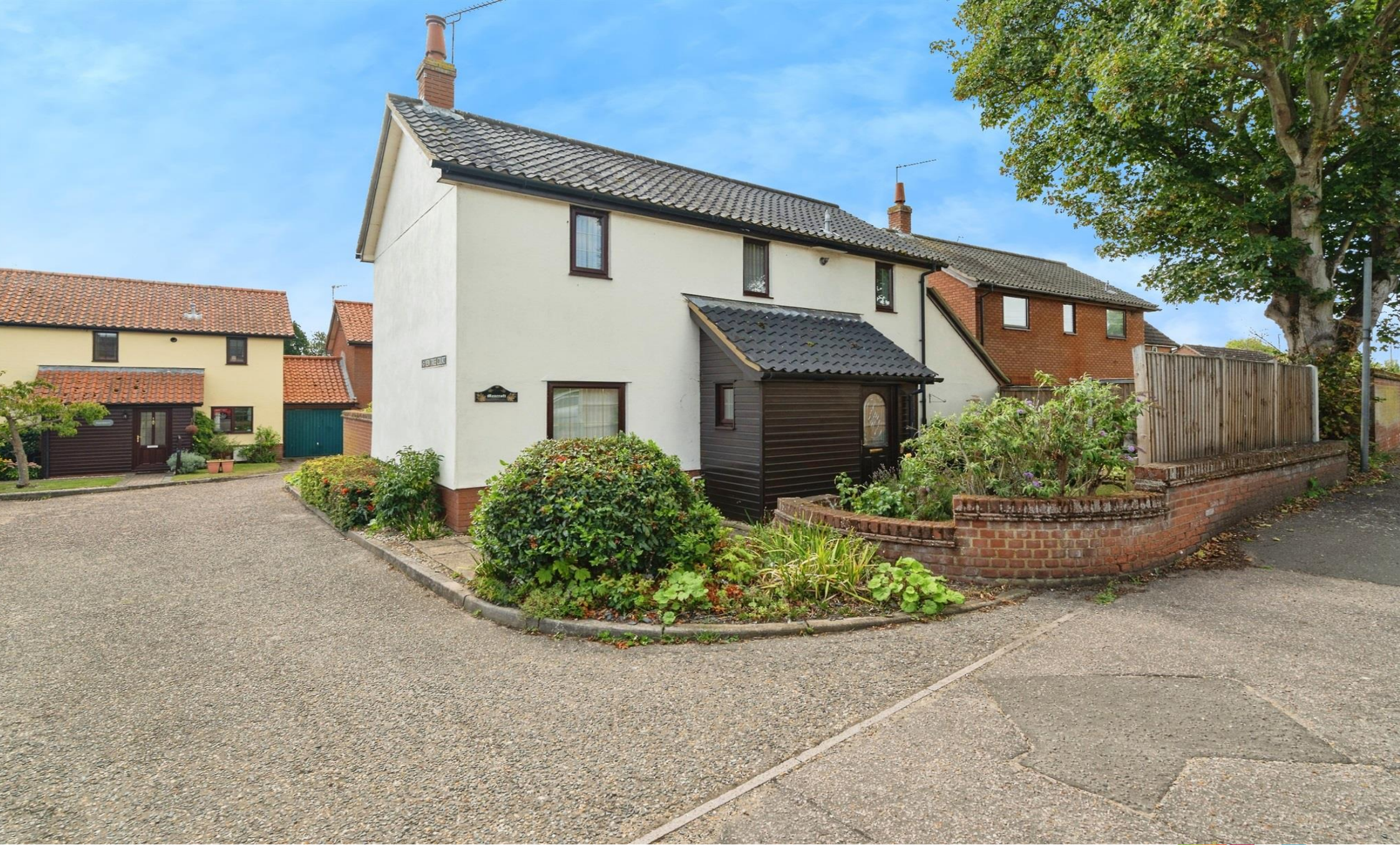
Mancroft Yew Tree Court, Scole Diss IP21 4DD