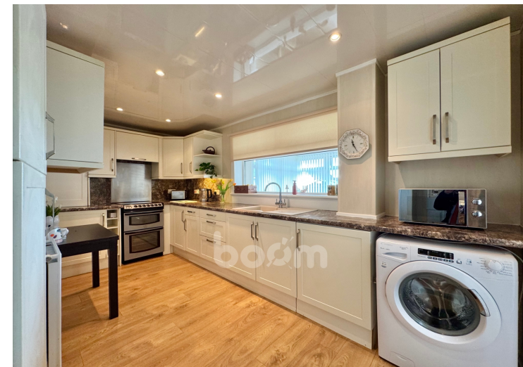
Lochlibo Terrace, Barrhead