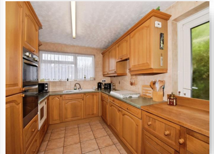
Ennerdale Close, Oadby Leicester LE2 4TN