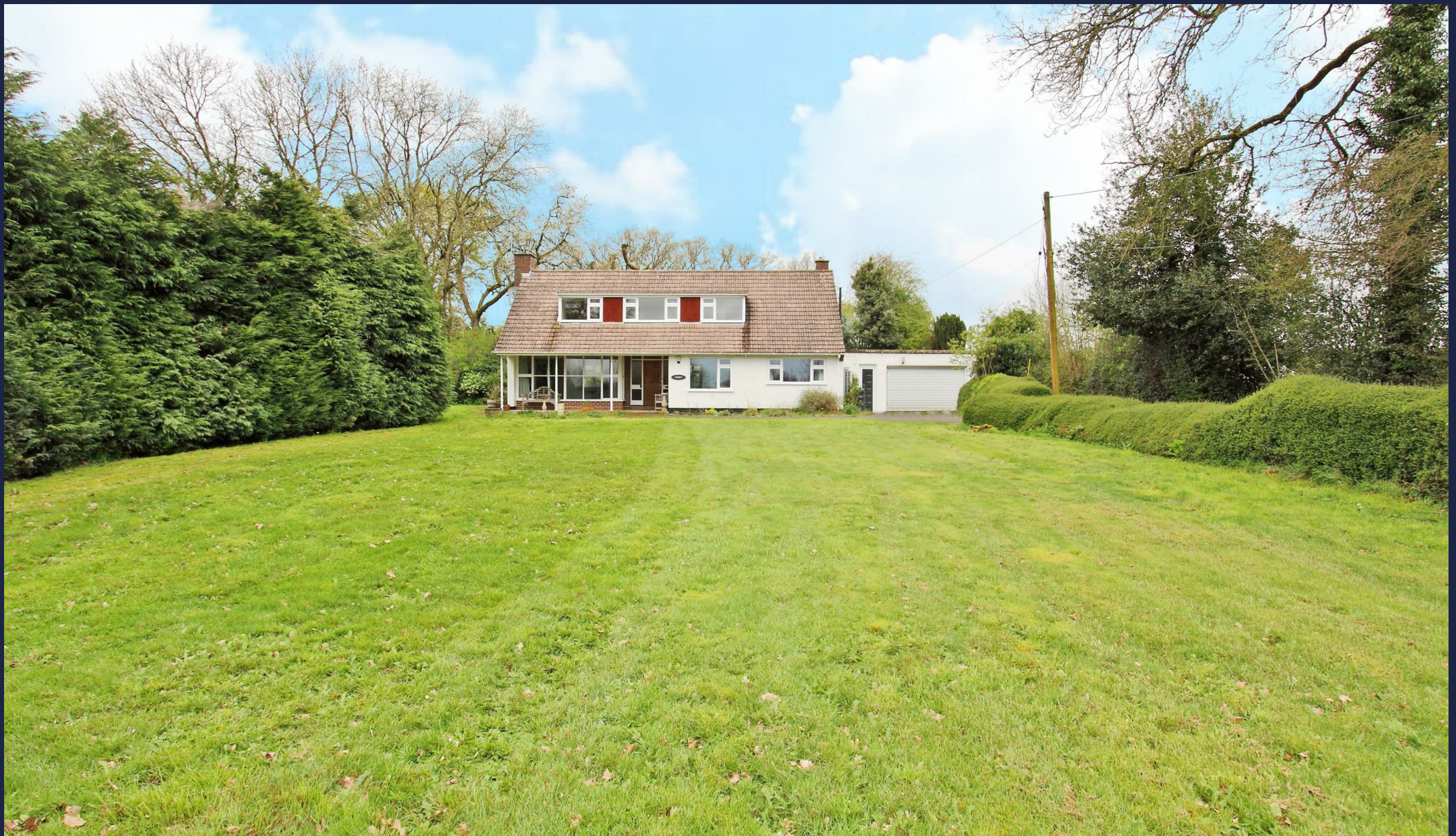
Fairview, Hatchett Hill, Andover