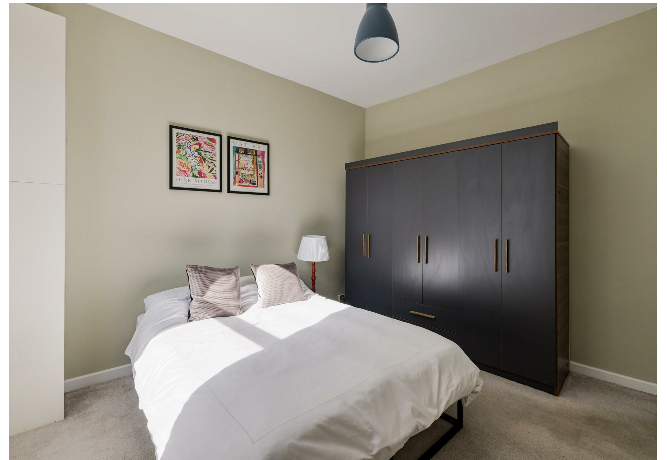
Bedroom 10'2" x 12'5"