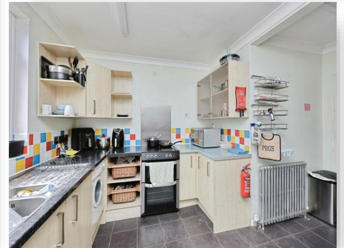
Waring Road, Norwich, NR5 8RL