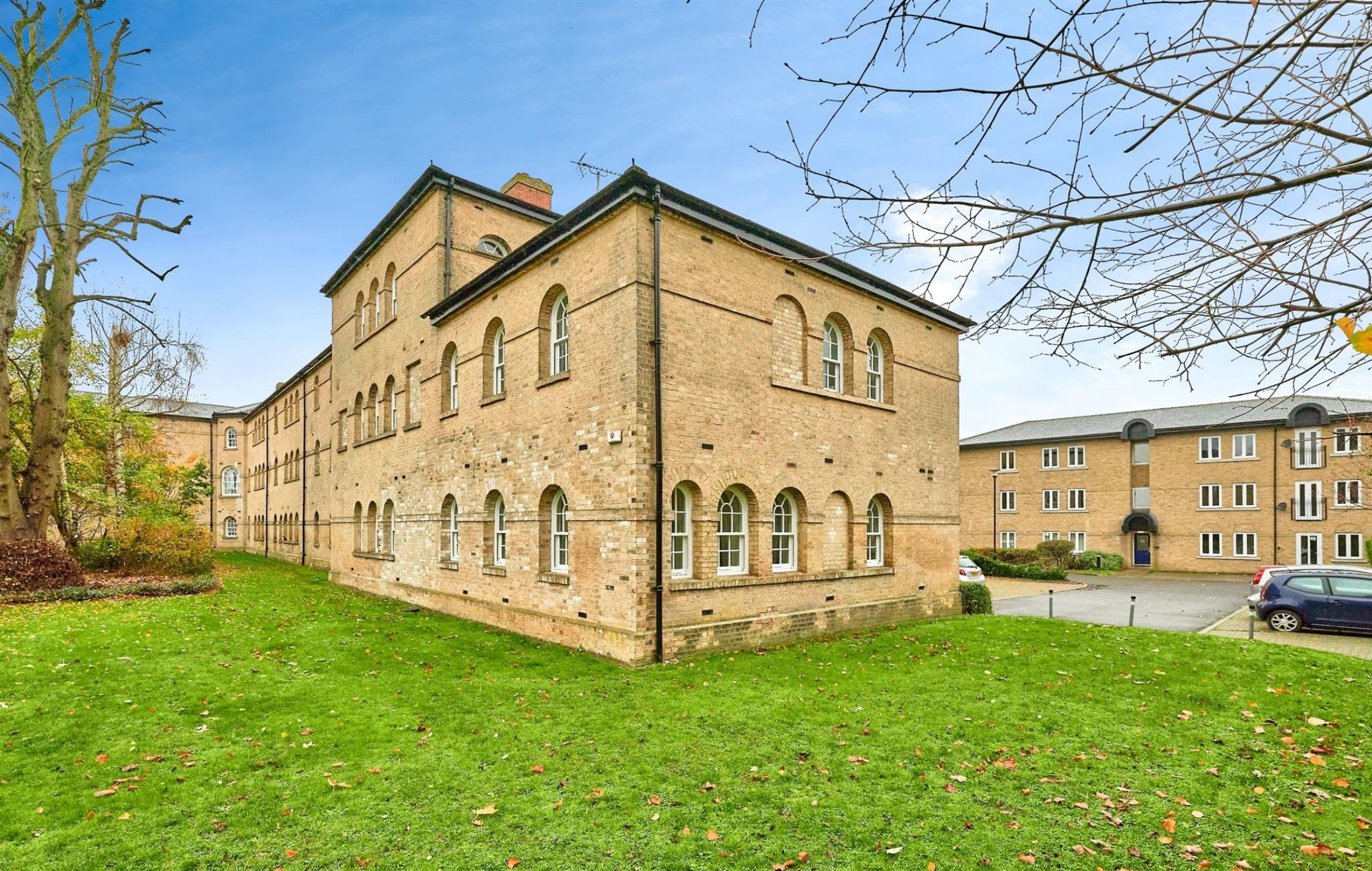
The Spike, Radwinter Road, Saffron Walden OIRO £350,000 Leasehold