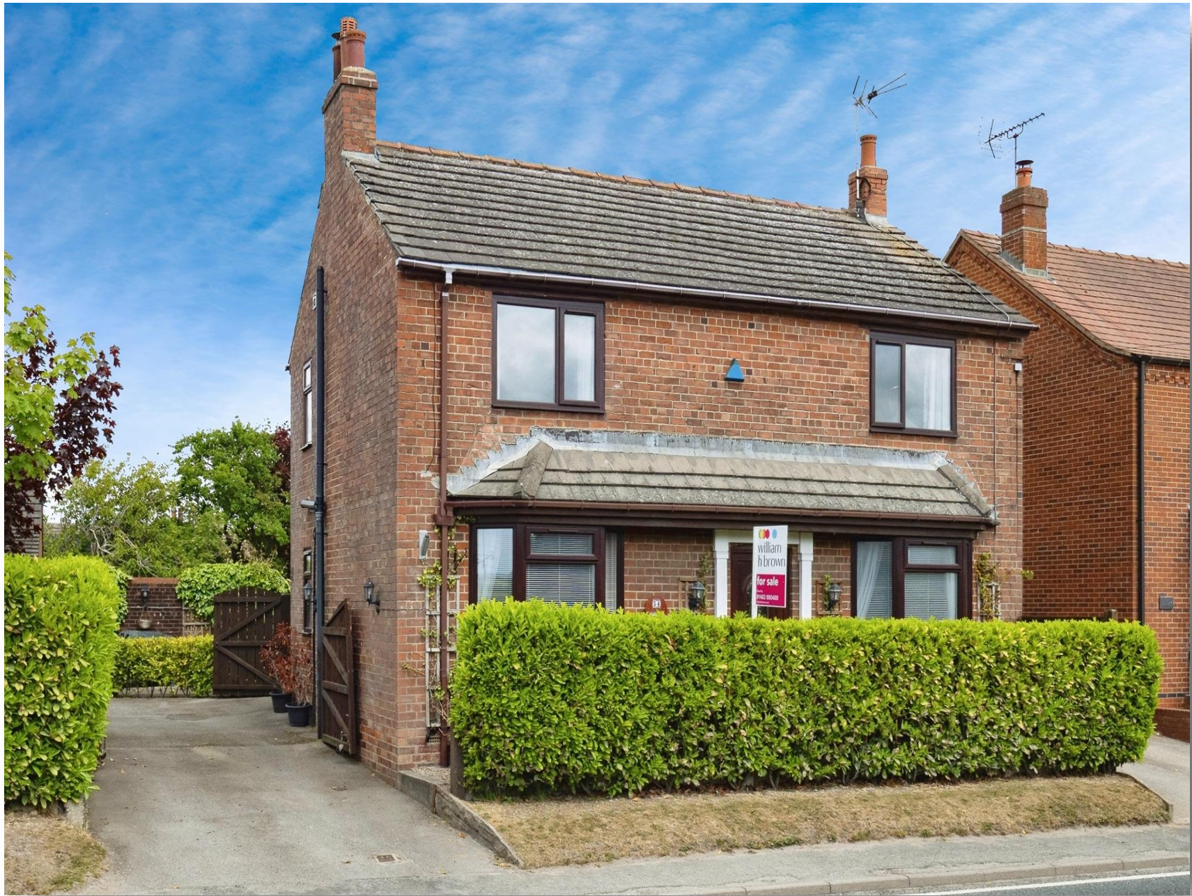
Main Street, Wetwang, Driffield, YO25 9XJ