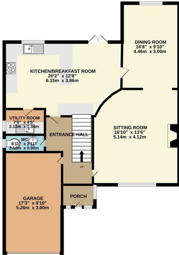
GROUND FLOOR 921 sq.ft. (85.6 sq.m.) approx.