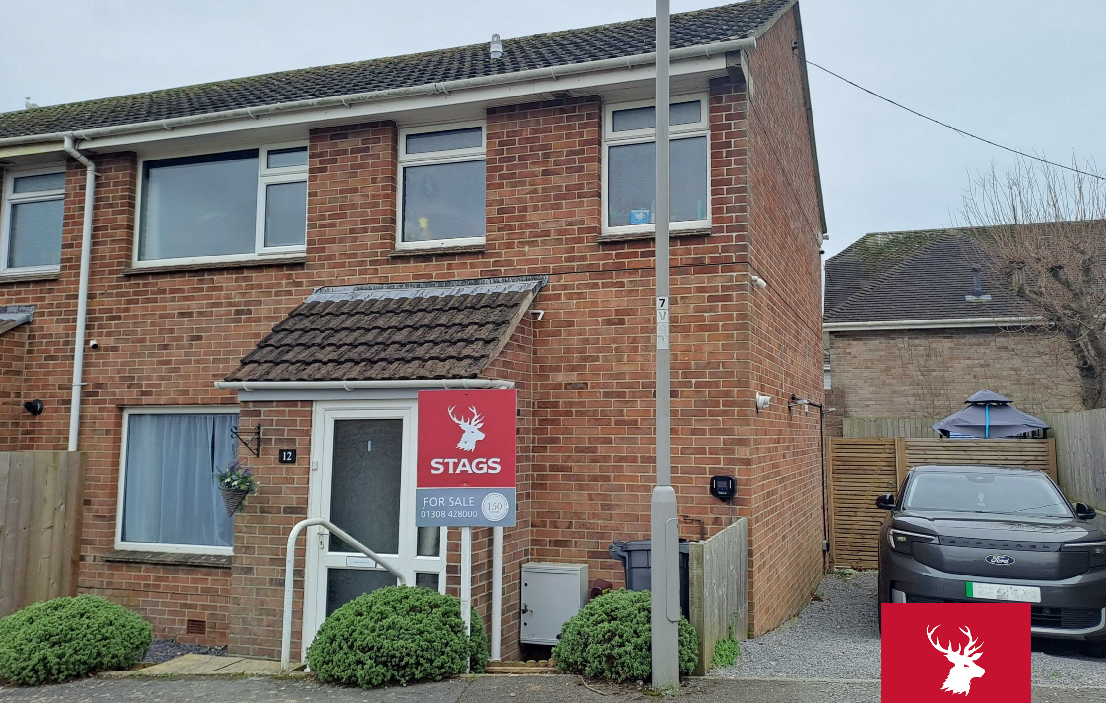
12, Vearse Close