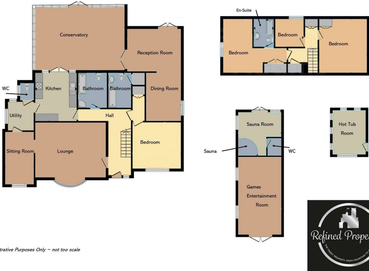
For Illustrative Purposes Only ~ not too scale