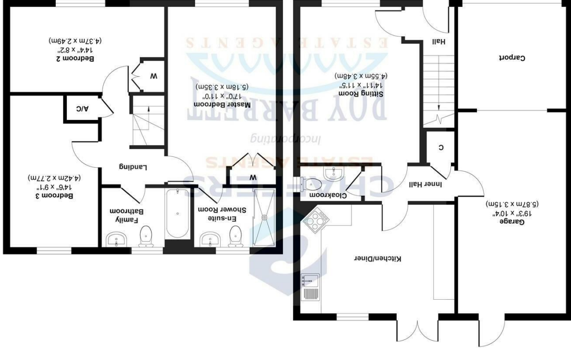
Approx. Gross Internal Floor Area 1222 sq. ft. / 113.52 sq. m (Including Garage & Excluding Carport)

Illustration for identification purposes only, measurements are approximate, not to scale. Produced by Elements Property