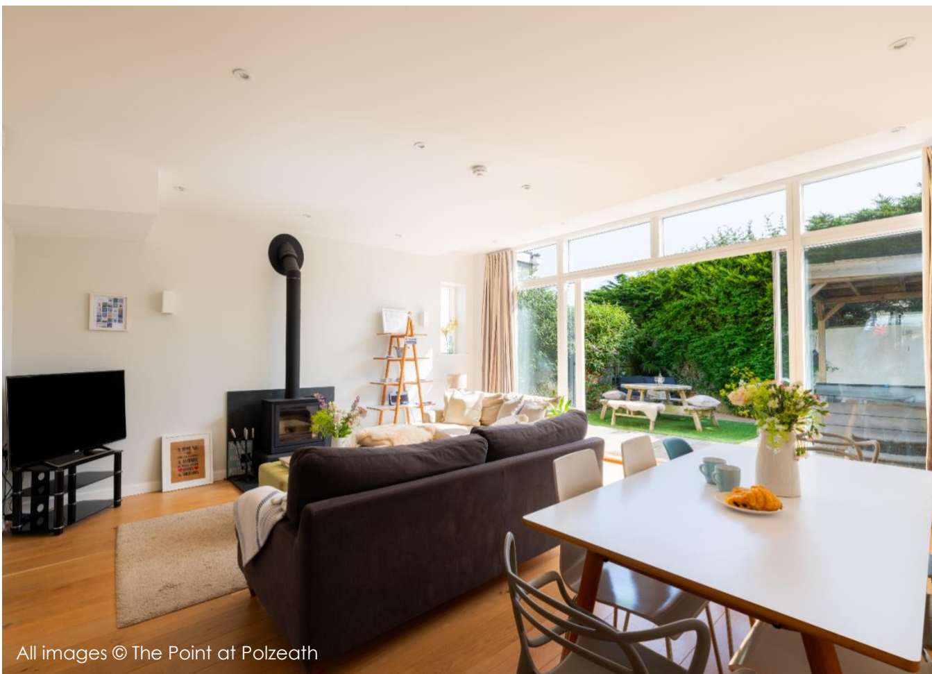
All images © The Point at Polzeath