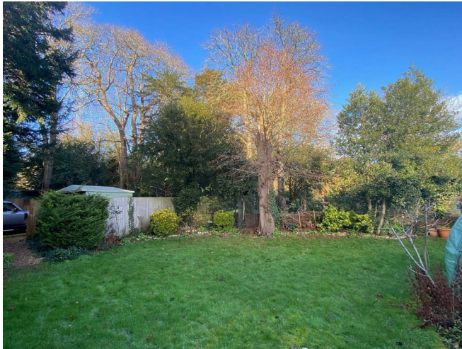
View of the back garden.