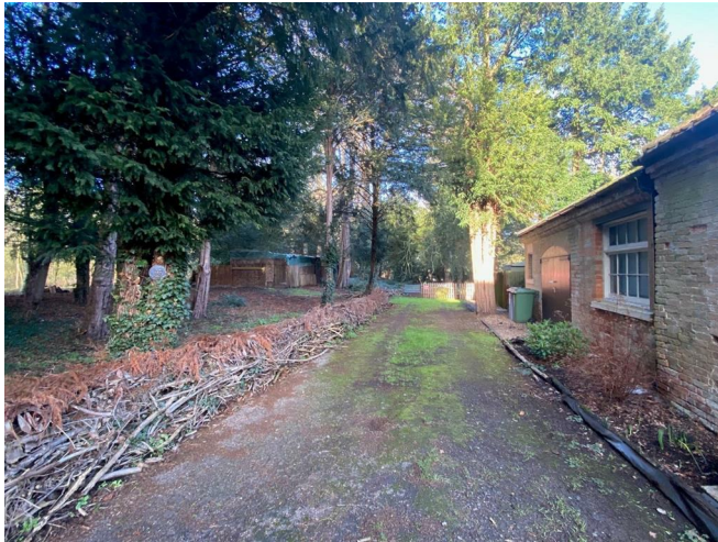
View along side of the Coach House.