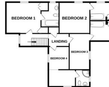
1ST FLOOR 939 sq.ft. (87.3 sq.m.) approx.