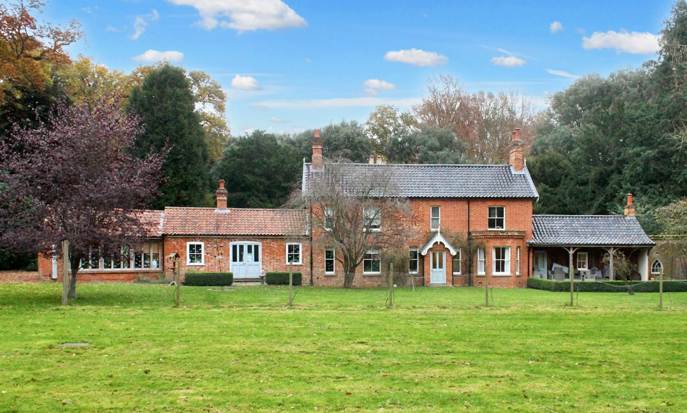
Orchard House, Melton Park