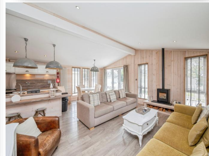
Alder Country Park, Bacton Road, North Walsham NR28 0RA