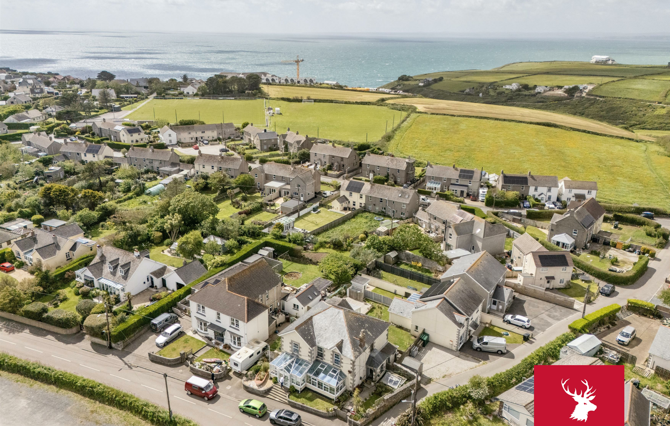
Ridgeback Lodge Hotel