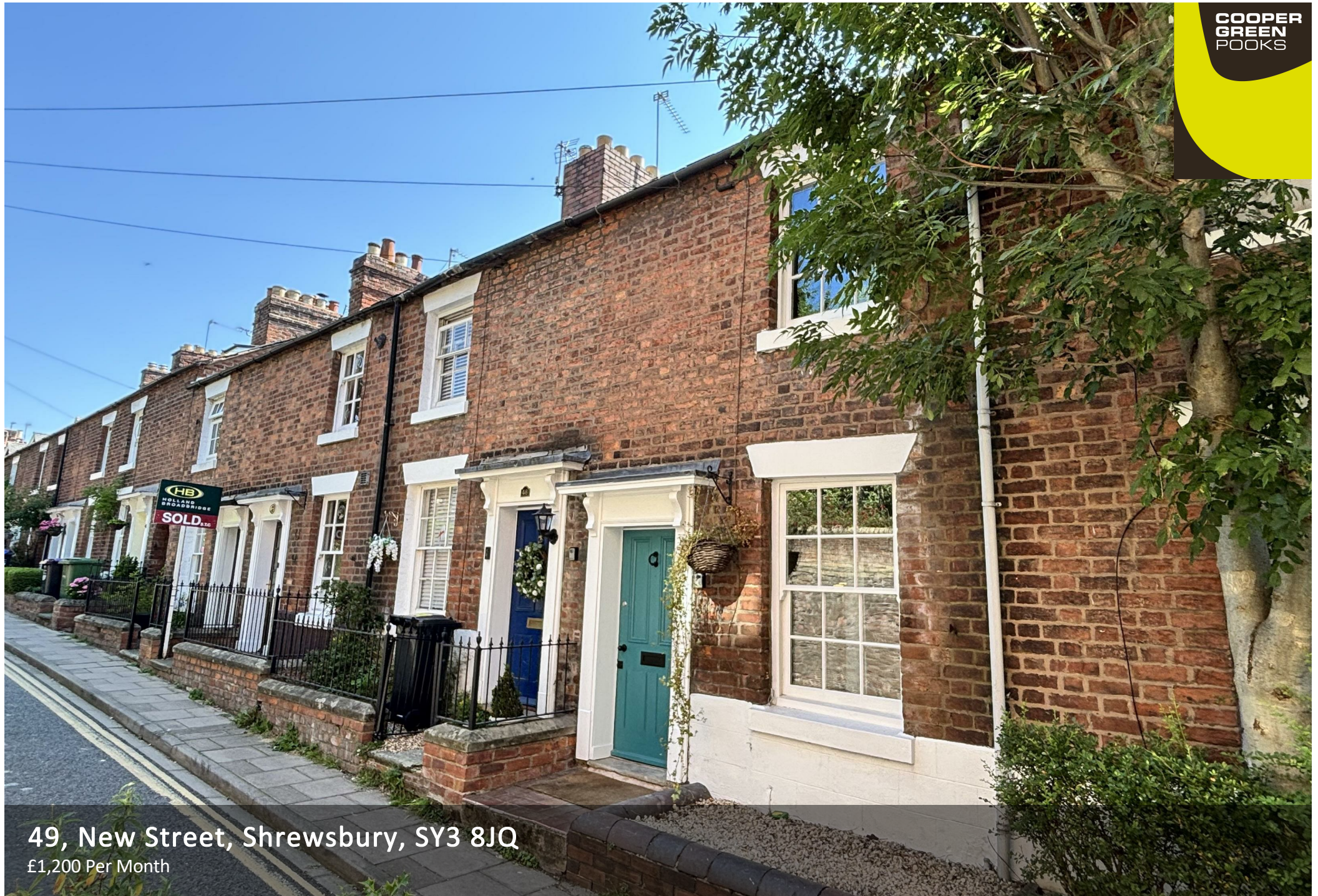
49, New Street, Shrewsbury, SY3 8JQ £1,200 Per Month