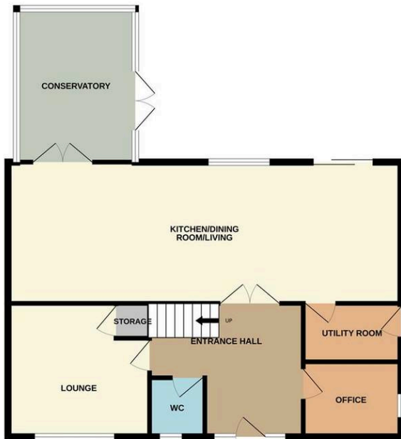
GROUND FLOOR 880 sq.ft. (81.8 sq.m.) approx.