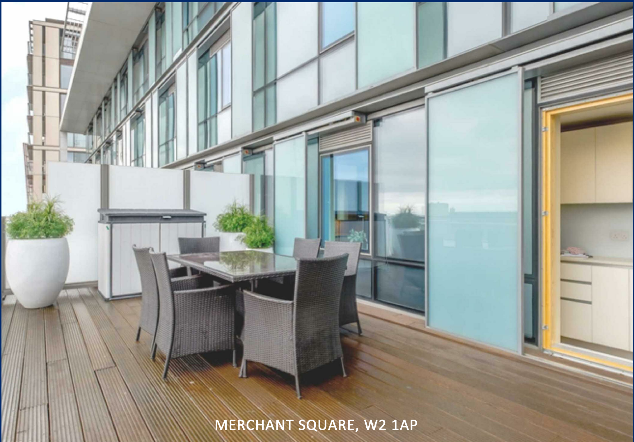
MERCHANT SQUARE, W2 1AP