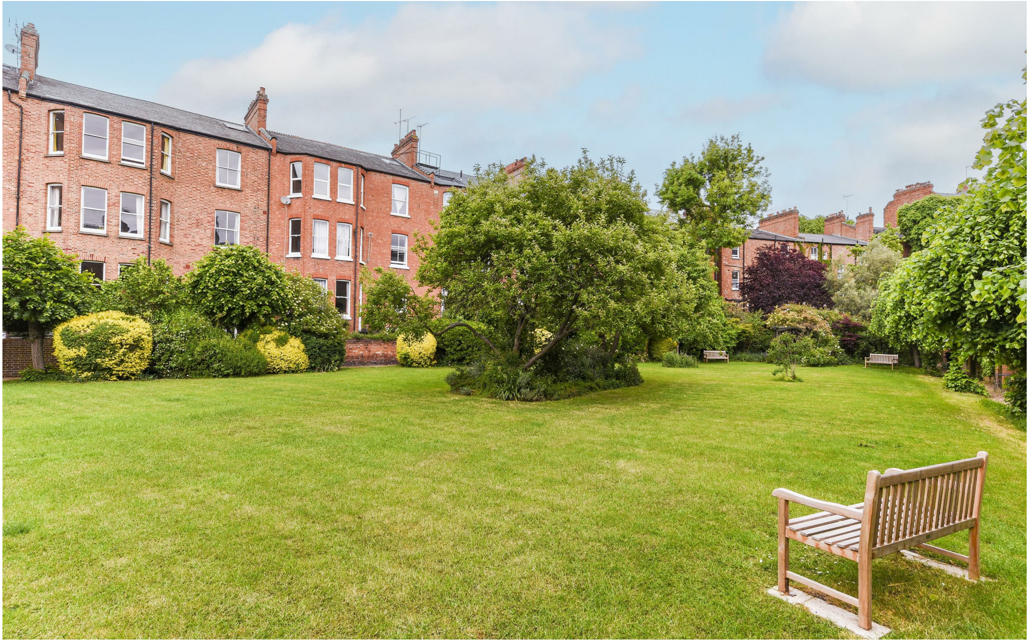
Compayne Gardens NW6