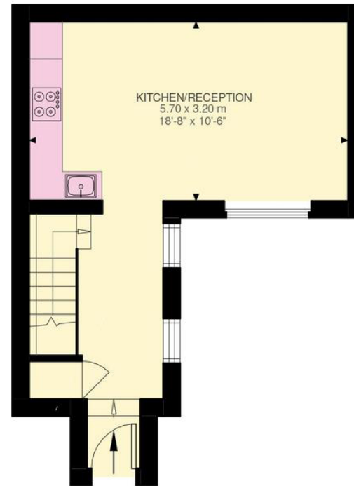
Ground Floor 306 ft 2

Approximate Gross Internal Area = 55.42 sq m / 597 sq ft