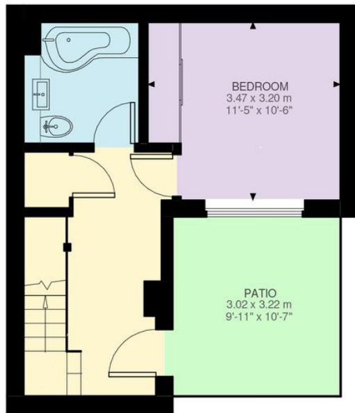
Lower Ground Floor 291 ft 2