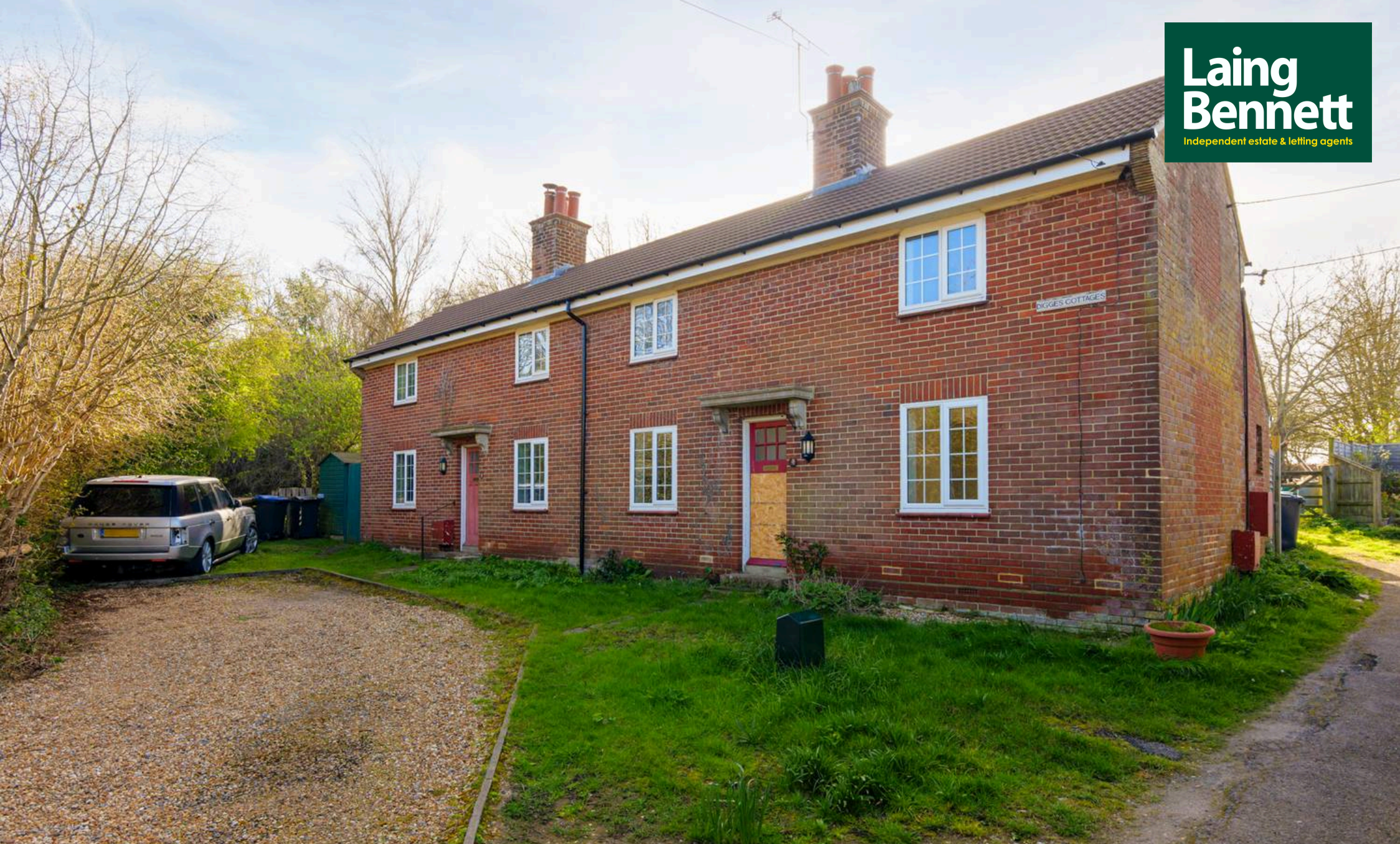
1 & 2 Digges Cottages, Out Elmstead Lane, Barham - CT4 6PH £575,000