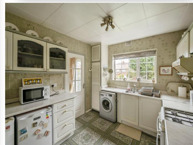
Carr Head Lane, Bolton-upon-Deane ROTHERHAM S63 8DD