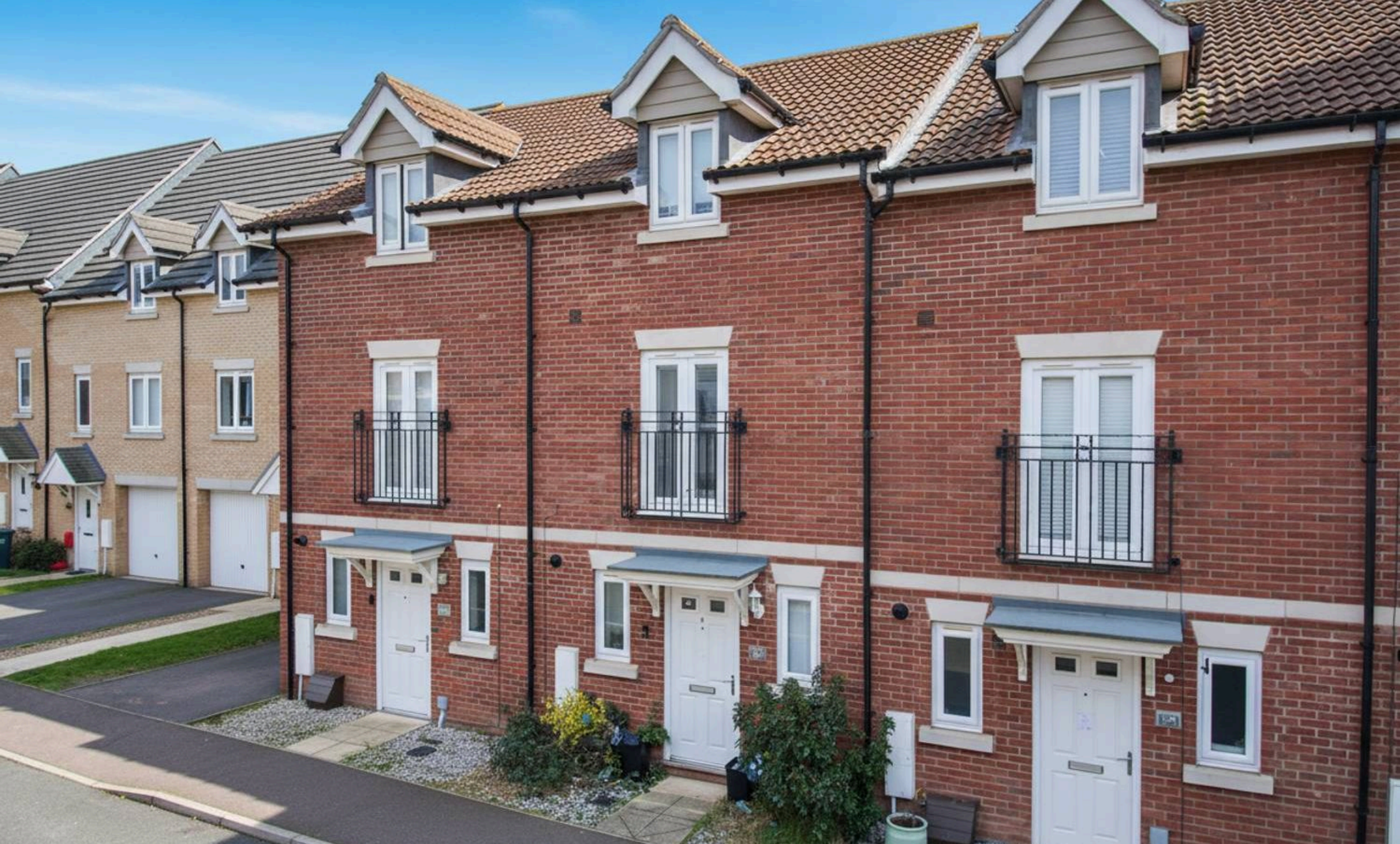
Falcon Crescent, Costessey - NR8 5GW