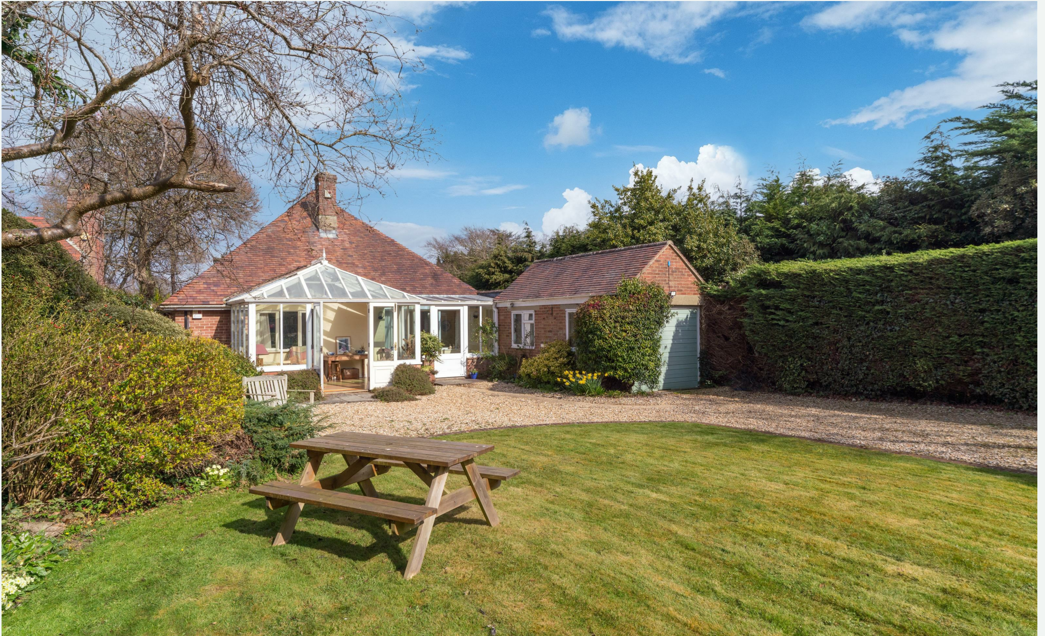
Westering, Swains Lane, Bembridge, Isle of Wight, PO35 5ST