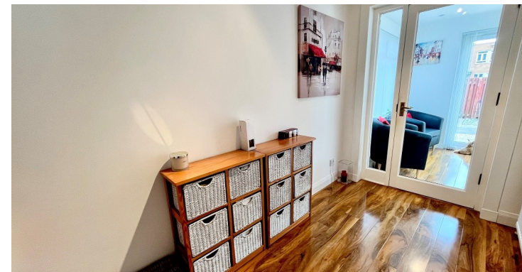
1 Munro Place