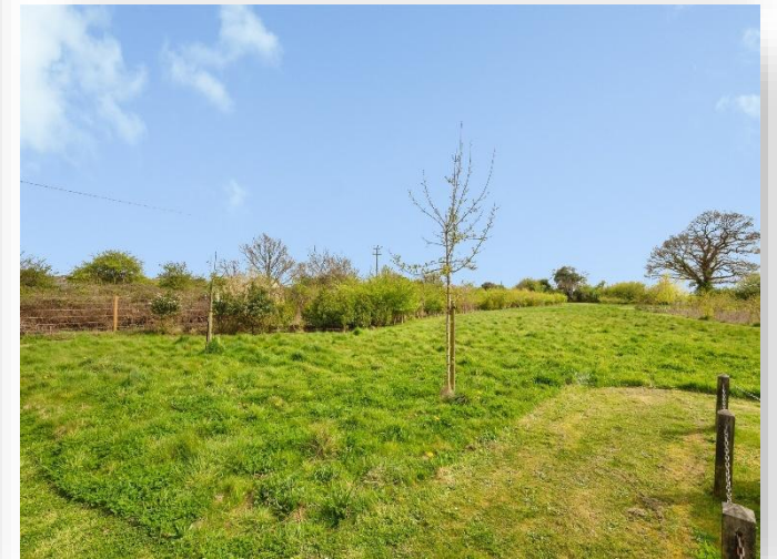
Peake House, Smedley Close, North Walsham NR28 0FL