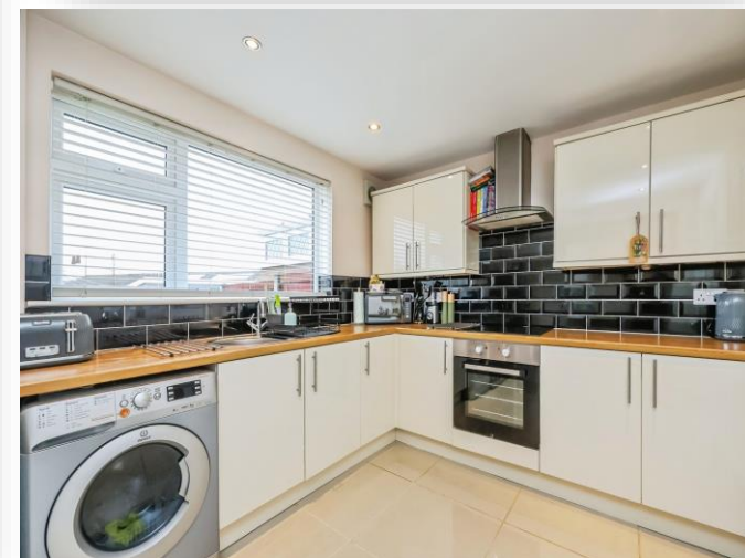
Bainton Grove, Nottingham NG11 8LF