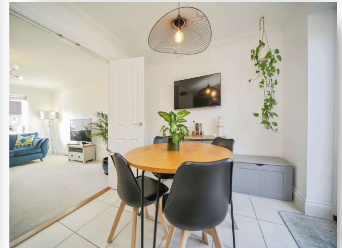
How Walk, Onehouse STOWMARKET IP14 1FL