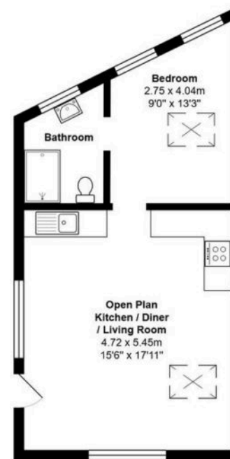
Annexe Area: 40.6 m 2 ... 437 ft 2