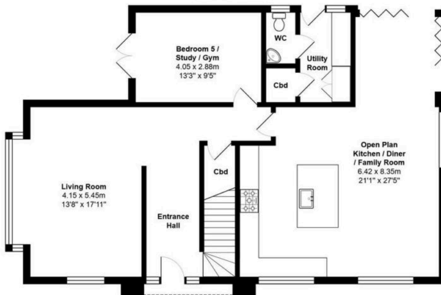
Ground Floor Area: 102.7 m 2 ... 1105 ft 2