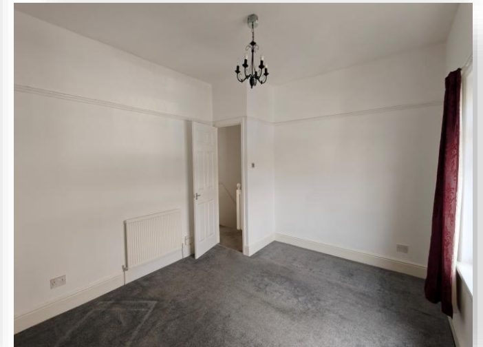
Wallasey Road, Wallasey, CH44 2AB