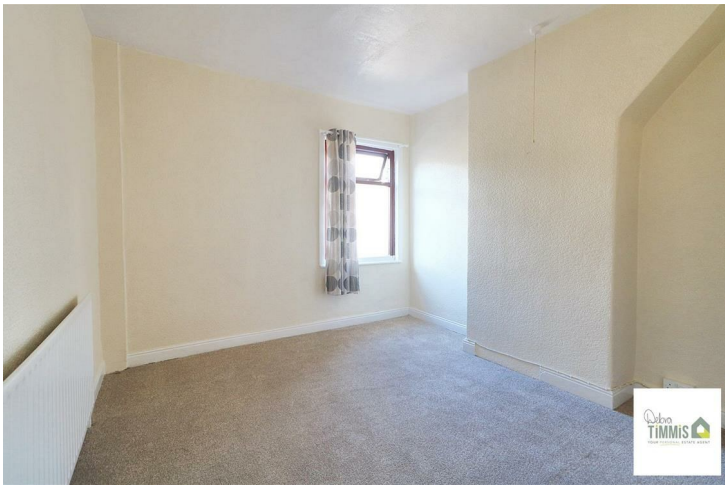
Bedroom Two 11'1" x 10'9" (3.38 x 3.30) Double glazed window. Radiator.